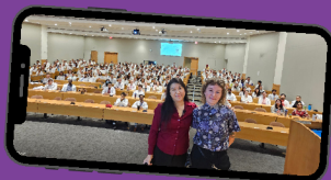
interACT speaks to Jefferson Medical students

Are you a member of an LGBTQIA+, human rights, children's rights, or health organization?